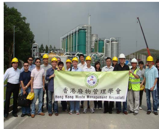
Group photo taken at the Landfill Gas Treatment Unit