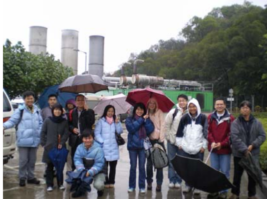
Course Participants in front of the Gas Treatment and Utilisation Facility during a Study Visit to WENT Landfill

This course was designed for those who need to formulate company environmental policy or improve their environmental performance. It started with the fundamental concepts of environmental management, pollution prevention and control followed by waste management policy, treatment and disposal methodologies to procurement and financing options for waste management facilities. To supplement classroom training and experience sharing, technical visits were also arranged for the participants to enhance their knowledge of the operation of waste management facilities including automatic refuse collection system, refuse transfer station and landfill. Based on a holistic approach, which integrates science, technology, legislation, economics, society and environment, the participants were provided with a convenient and formal qualification addressing government policy and legislation as well as business ethics.