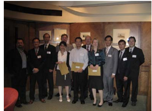
Some of the Course Participants with their Lecturers after Receiving their Certificates at the HKWMA Spring Reception held on 29 April 2008

After rigorous training and assessment, all the participants were presented with Certificates of Performance or Certificates of Attendance at the HKWMA Annual Cocktail Reception held at the Hong Kong Club on 29 th April 2008. They became members of HKWMA with a subscription fee waiver for one year. The qualification is also recognized under the Government's Continuing Education Fund Scheme.