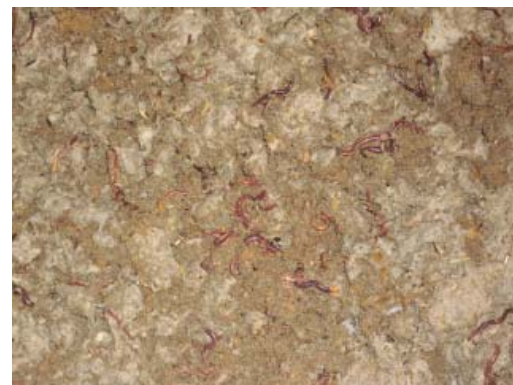
The Worms at Work in the Demonstration Unit

Sunburst's plant near Kam Tin is in an old pig farm. Their ideal would be to site their facility on a landfill but they had not been able to make the necessary arrangements so far.