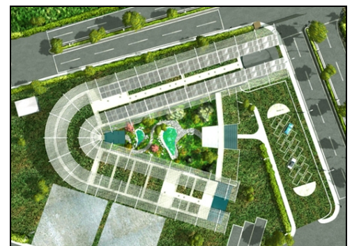
Administration Building at EcoPark

The history of EcoPark examined the need for the facility and described the studies that were undertaken; the design and construction of EcoPark examined the rationale for the layout of the site, and in particular addressed the environmentally sustainable design aspects included in its construction; and the operation of EcoPark reviewed the tendering process adopted for tenants, the difficulties encountered and the successes to-date of the project.