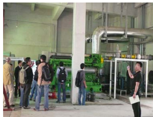
Landfill Gas-fueled Engines Supplying Electricity to the Shenzhen City Grid