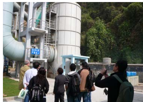
Leachate Treatment Plant