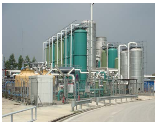
Landfill Gas Treatment Unit

NENT Landfill Gas Export Project is based on a Sales Contract between Far East Landfill Technologies Ltd. (FELT) and the Hong Kong and China Gas Co., Ltd. (HKCG). The scope of this project is to supply treated landfill gas to the Towngas Production Plant at Tai Po to be used as heating fuel in the towngas production process. The project execution included the design and construction of a Landfill Gas Treatment Unit and a 19 km long underground gas pipeline from NENT landfill to the Towngas Plant at Tai Po.