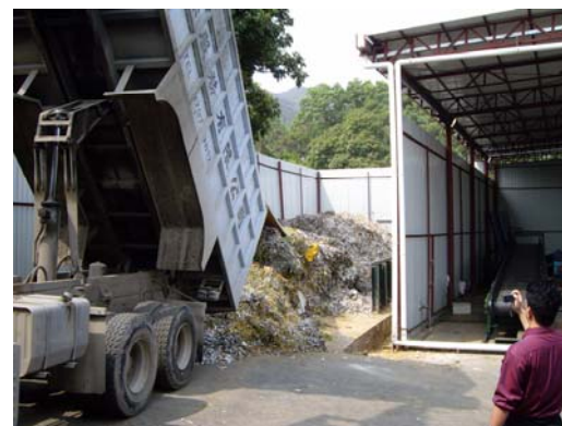
Delivery of Raw Material : Horse Manure with Shredded Paper Bedding

All incoming waste is weighed in over a weighbridge and it is then stacked in two separate areas : a carbon-based area for animal manure and a nitrogen-based area for food waste etc. The two materials are then blended together in a hyper-processor mixer to give an homogenised material with the optimum C/N ratio for the vermiculture process. Following the mixing the biological process starts. The mixed waste is dewatered by a belt process to 60-70% moisture content. It then sits for 7 to 10 days for preliminary composting.