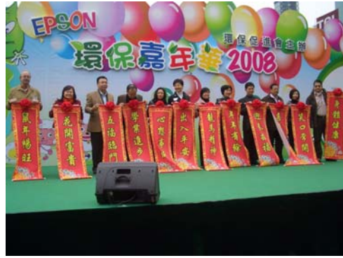
Carnival Opening Ceremony : HKWMA Chairman on Far Left

On 27 January 2008, the Green Council hosted a Green Carnival at Wanchai Sports Ground. This was the fourth time HKWMA participated as a supporting organization in this annual event. Thousands of students and their family members attended this fun day.