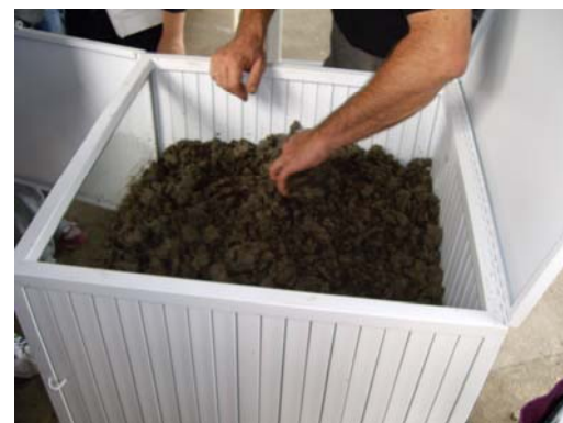
Demonstration / Domestic Size Vermiculture Fertiliser Production Unit

Sunburst's demonstration plant in Hong Kong presently has an intake of 50 tonnes of organic waste a day but they are now ramping up the operation to be able to take 200 tonnes a day. Sunburst's facility was running for 12 hours a day, 7 days a week and that was soon to be stepped up to 16 hours a day. The facility could run 24 hours a day if the demand was there. The ideal throughput for a typical vermiculture processing plant is 200 to 400 tonnes per day.