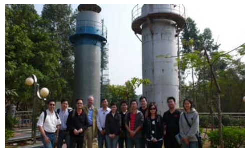
Group Photo in front of the Landfill Gas Flaring System