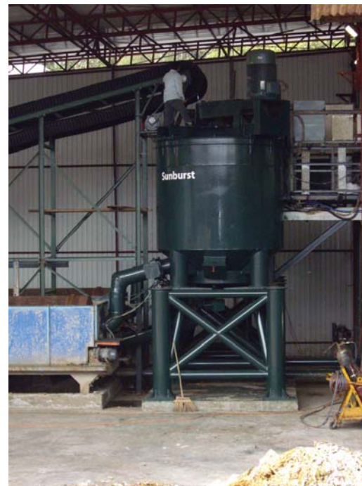
Mixer for Blending Raw Materials into Mixture with Optimum C/N Ratio