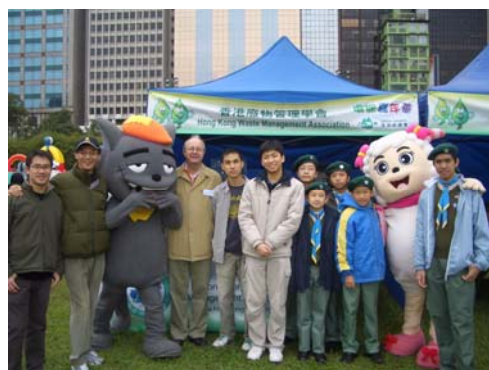
Chairman, Training and Education Co-ordinator and 'Helpers' in front of HKWMA Booth

All the participants and visitors enjoyed a fun but cool day! They brought home the message of waste reduction and recycling.