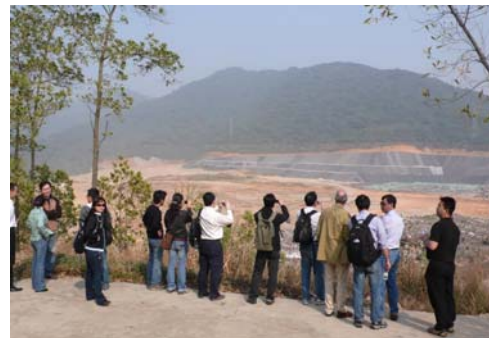
Overview of the Active Tipping Face

The visit was very interactive and was well-received, providing all members with an updated perspective of the current landfill management practices and commercial drivers/incentives in China.