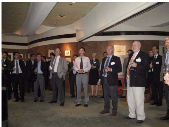
Members and Guests at the Reception