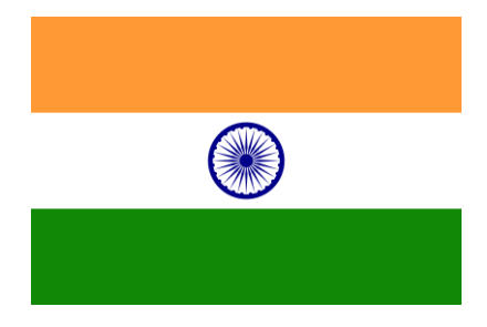
National Solid Waste Association of India