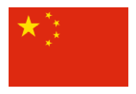
Guangdong Environmental Sanitation Association