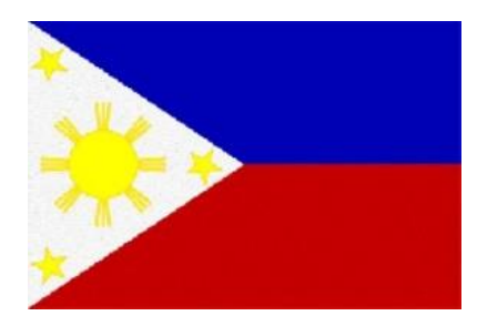
Solid Waste Association of Philippines