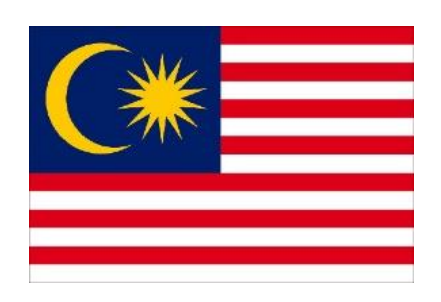
Waste Management Association Malaysia