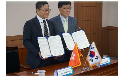
Signing of Cooperation Agreement