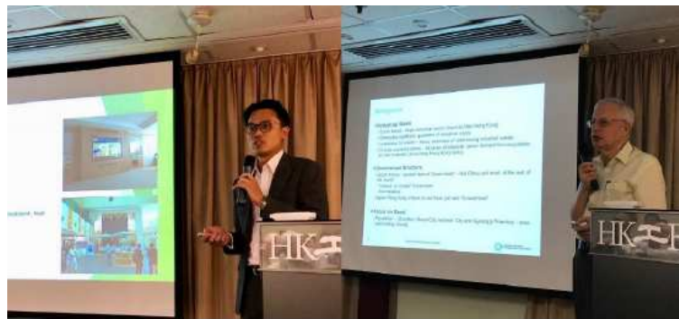
Delegation Members Reporting Study Tour Findings at HKIE