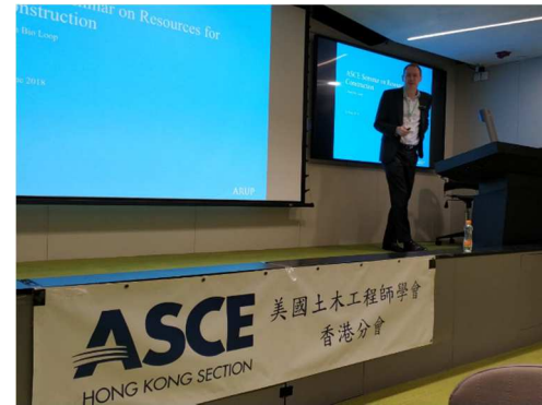
Presentation of Urban Bio-Loop Concepts