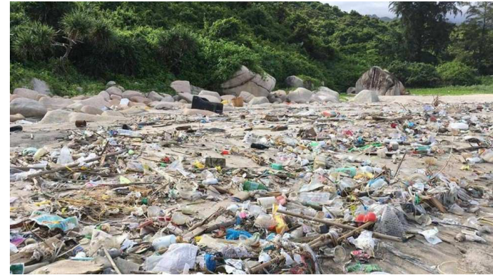
Waste Debris Post Typhoon Mangkhut