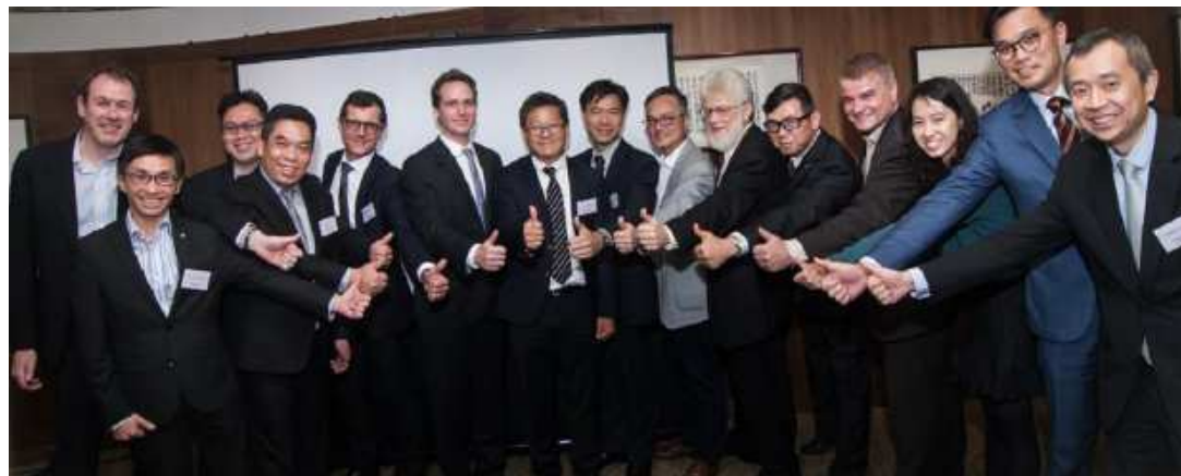
Executive Committee Members with Guest of Honor enjoying the reception

The speaker encouraged the audience to utilise the collection service at the hotline number of 2676 8888 for responsible disposal of e-waste since the infrastructure was now in place to support behavioural change. The speaker highlighted that e-waste was an ethical challenge that all countries needed to tackle by taking responsibility for their own waste and many opportunities remained in Hong Kong to recover other waste streams to achieve a closed loop economy and to do more with its waste that dispose to landfill.