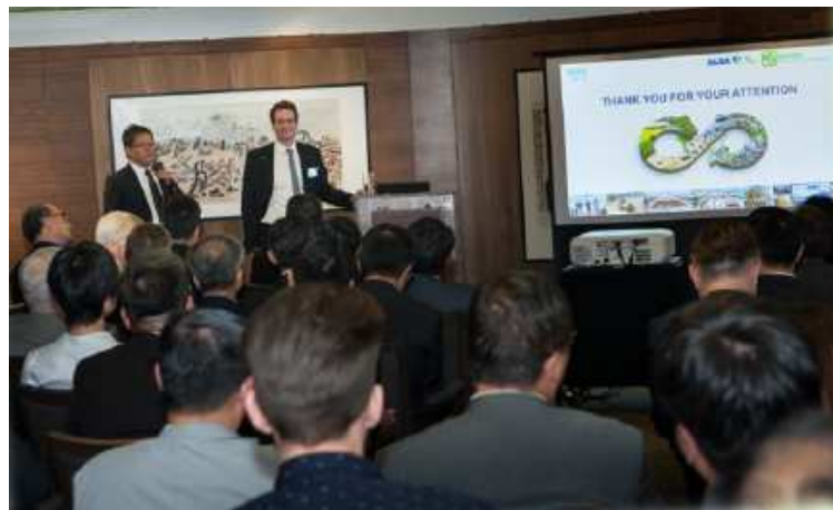
Members and guests enjoying the chairman’s report and reception

The WEEETRF is special in that it is a holistic system that links collection, treatment and end markets. The facility has a sophisticated IT system that enabling tracking of materials throughout the product lifecycle. The plant is licensed to treated regulated materials and has an operating capacity of 30,000tpa that could be increased to 57,000tpa by extending shifts and operating hours and is supported by five regional collection centres.