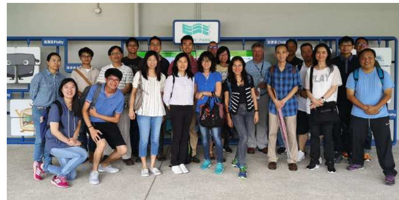
Group Photo of Young Members Committee at WEEE Park Visitor Centre